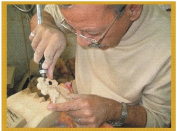
Carve the faces of the figures

Fourth phase , finishing is a time and effort consuming process; long hours are invested in inspecting each piece to eliminate any imperfections before it is sprayed with transparent sealant to protect it from weather variations and highlight its natural colour.