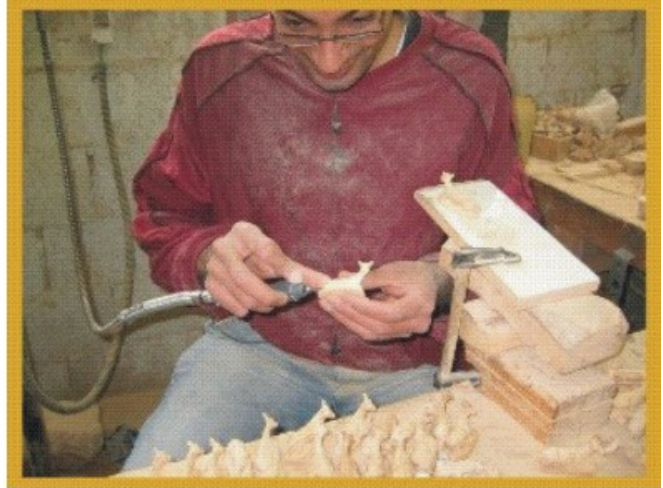
Hand carving and putting the small details