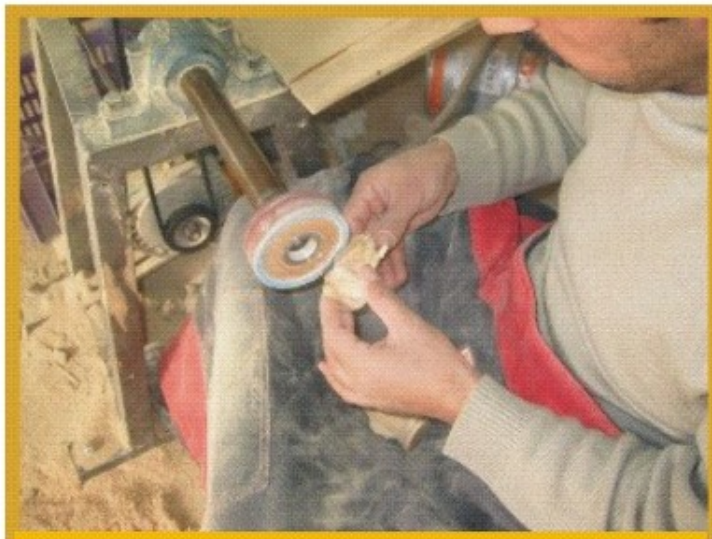
Sanding the big areas