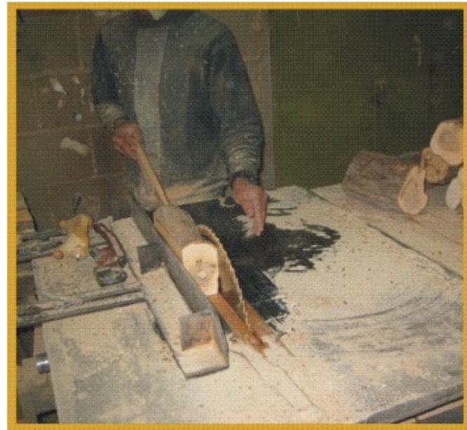
Cut the wood to the size that is needed